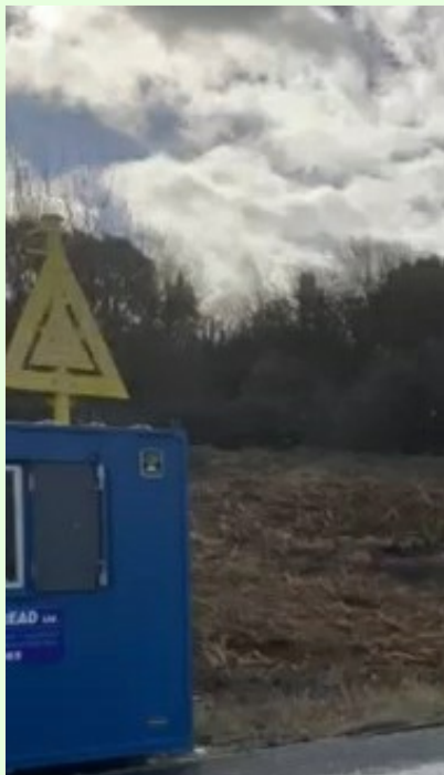
Photos - top left, looking east towards Cowes; left and above, panning to the right.